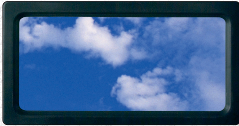
12 x 24