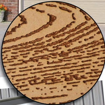
Model 31 and 33 exterior detail